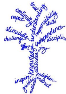
Hinchley Wood Primary