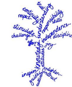
Hinchley Wood Primary